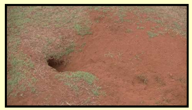
↑ In soft soil.