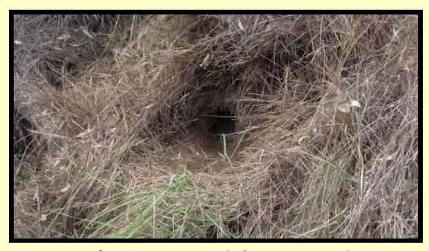
↑ In long grass like `African lovegrass'.