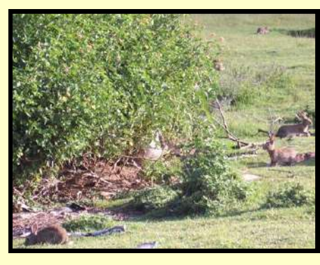
↑ In weeds like lantana and boxthorn.