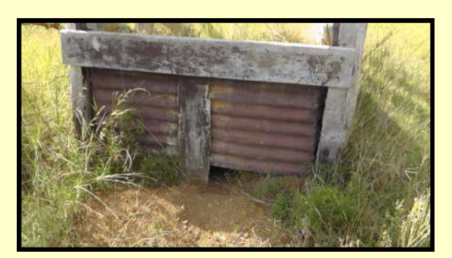
↑ In loading ramps.