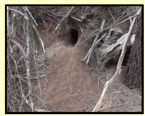
↑ In mounds of soil mixed with timber.