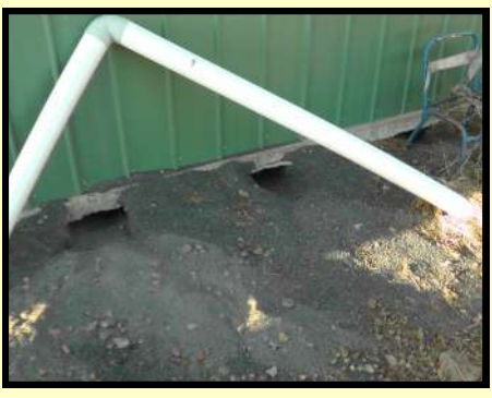
↑ Under concrete slabs.