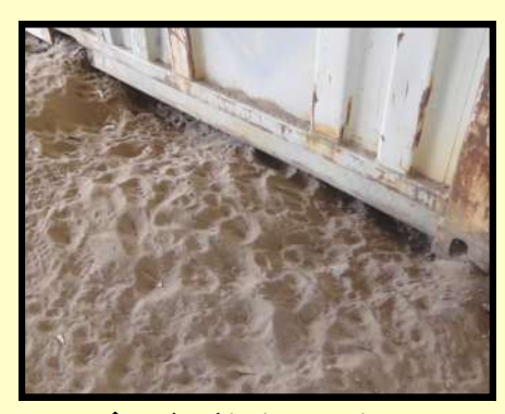
↑ Under shipping containers.