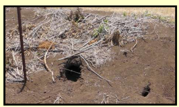
↑ In contour banks.