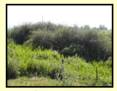
↑ Along creek banks.