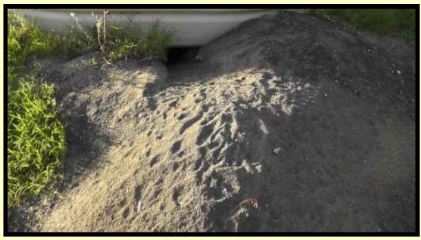
↑ In crusher dust