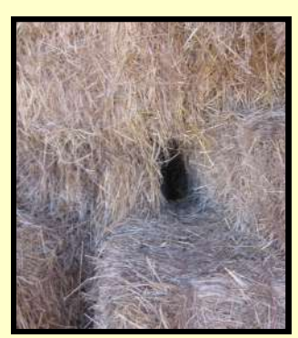
↑ In haysheds.