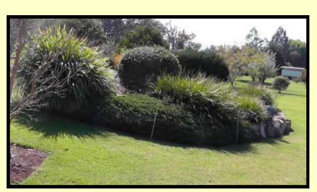
↑ In low, shrubby gardens.