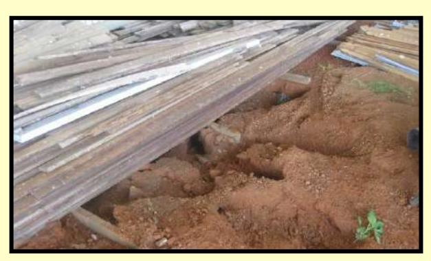
↑ Under materials stored on the ground.