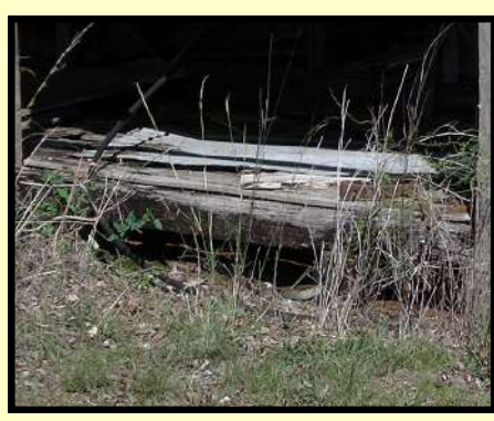
↑ Under low-set buildings.