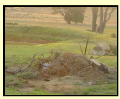
↑ In rubbish piles.