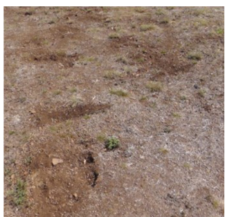
Lots of scratchings