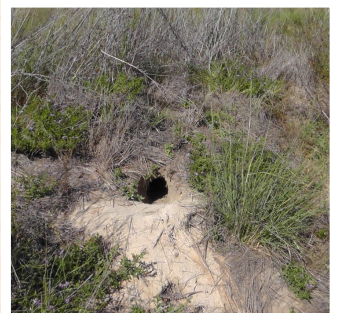
An active burrow (fresh soil, tracks & pills)