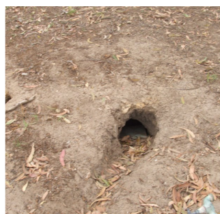
A disused burrow