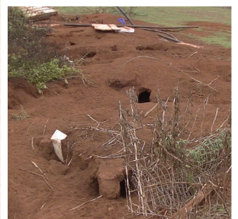
A network of burrows ("warren")