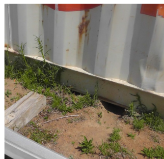
Entrance under objects on the ground