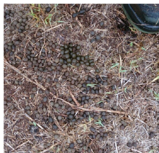
Dark, fresh droppings ("pills")