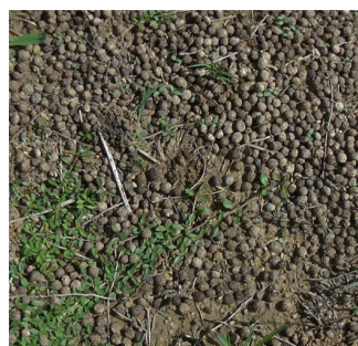
A large dung pile ("buckheap")