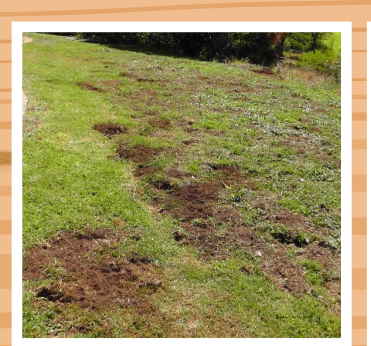
Lawn damaged by rabbits.

Rabbits are restricted invasive animals and one of Australia's worst agricultural and environmental pests. Affected landholders must take all reasonable steps to control rabbits.