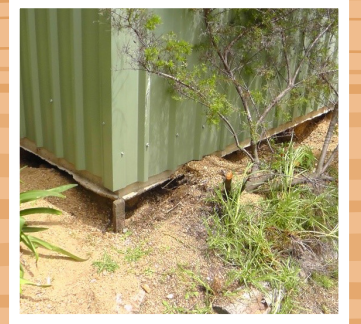
Concrete slab undermined by rabbits