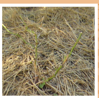
Young rose bush stripped by rabbits