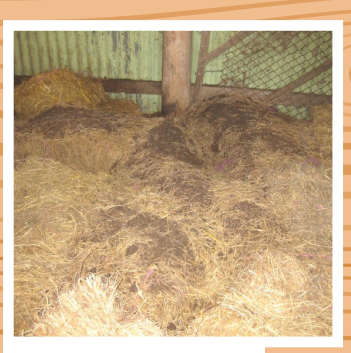
Hay ruined by rabbits.