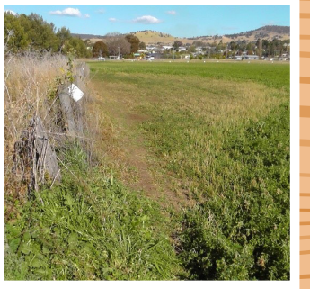
Edge of crop eaten by rabbits living in the creek bank.