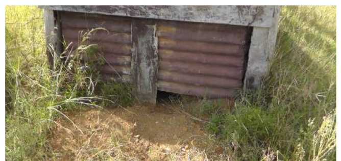
In loading ramps