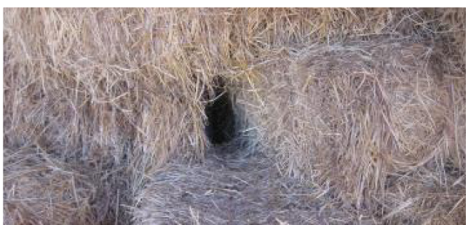
In long grass like 'African lovegrass'