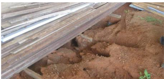
Under materials stored on the ground