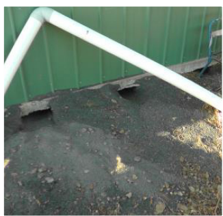
Under concrete slabs