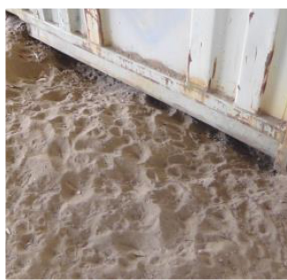
Under shipping containers