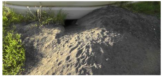
In crusher dust