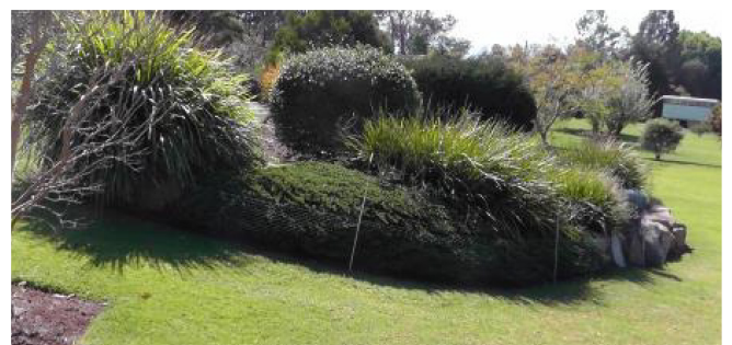
In low shrubby gardens