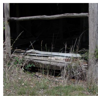
Under low-set buildings