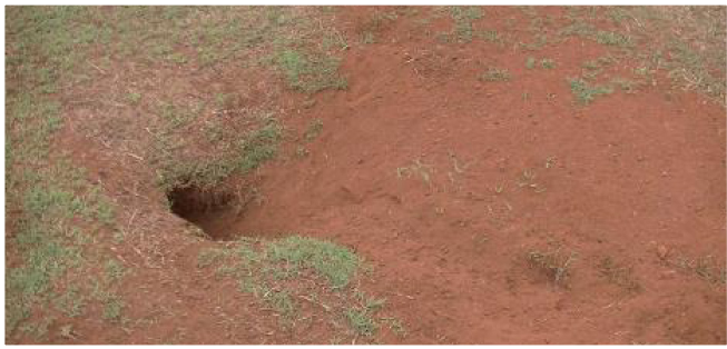
In soft soil