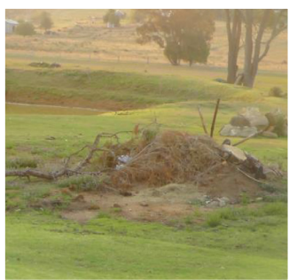
In rubbish piles