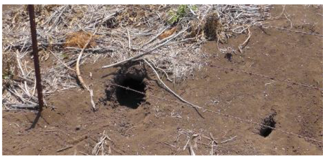
In contour banks