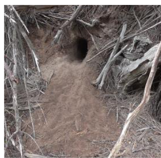
In mounds of soil mixed with timber