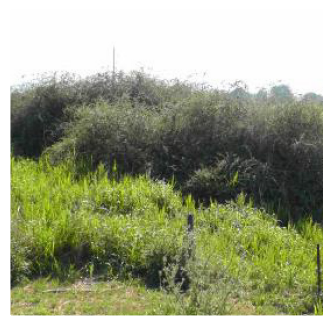
Along creek banks