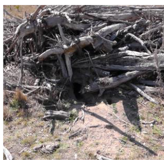
Under log piles