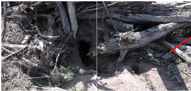
Rabbits in rubbish piles or log piles

If you're a landholder, you must take all reasonable steps to control rabbits on your property.