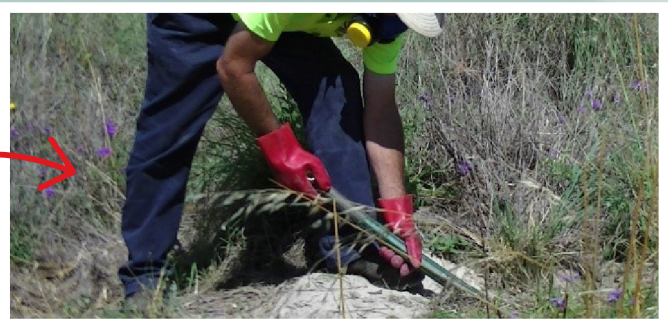
Fumigate burrows or dig them up