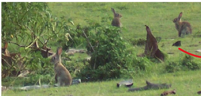
Rabbits in weed thickets like lantana.