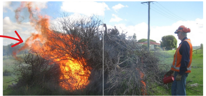
Obtain a 'Permit to light fire' from your local fire warden Burn in accordance with conditions on the permit