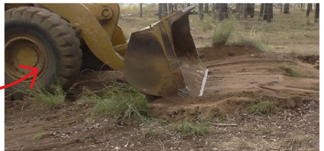
Spray weeds, remove dead weeds, collapse any burrows