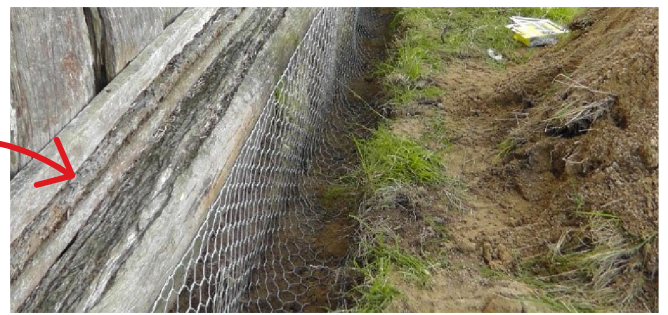
Dig a barrier into the ground to keep rabbits out