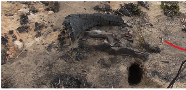
Warrens or lots of burrows

How do you control rabbits? It all depends on where they are living. This guide tells you what you can do about common rabbit problems. More than one method is usually needed.