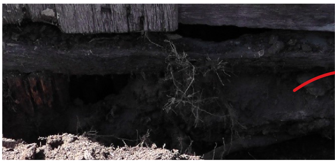
Rabbits under a low-set building