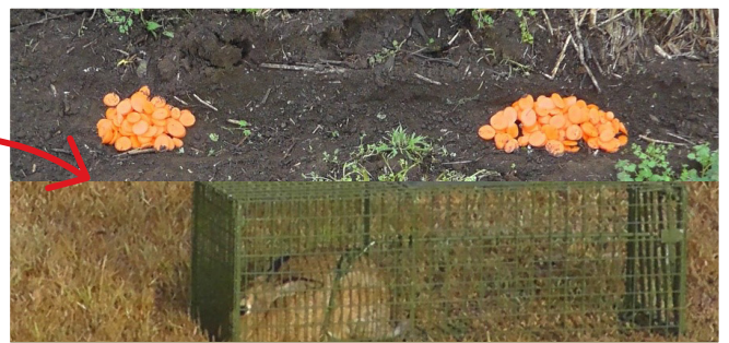
Pindone baiting or cage trapping