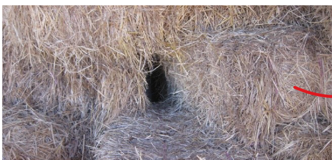
Rabbits in a hayshed