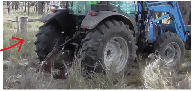
Use a machine with a ripper or a bucket to destroy the burrows