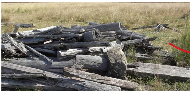
Rabbits living under materials lying on the ground