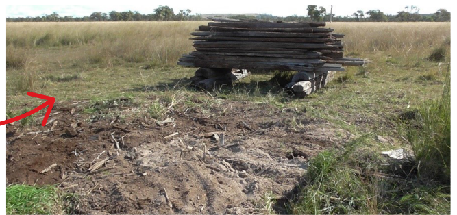
Remove or store materials over 40cm above the ground Collapse or fumigate any exposed burrows