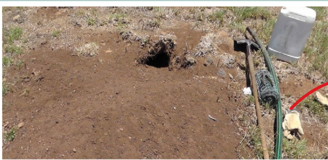
Single or isolated burrows.